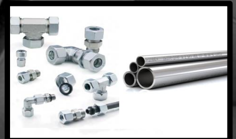
And Much More